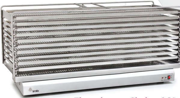
Thrombocyte Shaker 96A