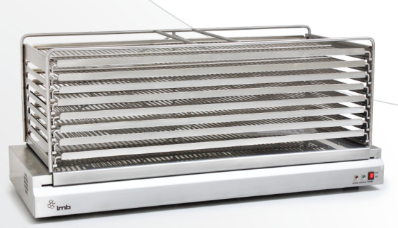
Thrombocyte Shaker 96